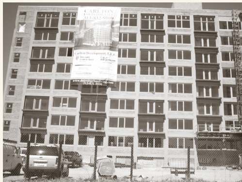
New loft project near downtown.

Although Detroit is notorious as America's fastest shrinking city, it is also at the nexus of some of the country's most creative thinking about the urban built environment. This urban landscape offers immense challenges, but also an unprecedented moment in which to think creatively about the kinds of opportunities presented by this confluence of social, economic and geographic factors. How does one redefine a city that has half the population it once had? What are the opportunities and challenges associated with the availability of large tracts of vacant land in or near the downtown? What does it mean when the "gaps" become the dominant urban form, outnumbering structures?