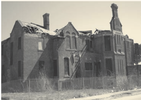
Abandoned building near downtown.

Modern Detroit is in many ways a city of contradictions. With a land area of 142 square miles, Detroit is one of the largest cities in the country – bigger than Manhattan, San Francisco, and Boston combined. It maintains its historic role as the center of the automobile industry,