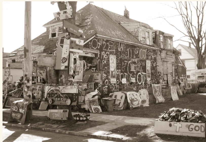
OJ or "Obstruction of Justice" House

Although it seems impossible in the face of such a troubled history, the Heidelberg Project is in many ways stronger today than it has