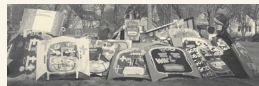
Top: Noah's Ark Center: Party Animal House Bottom: Faces in the Hood