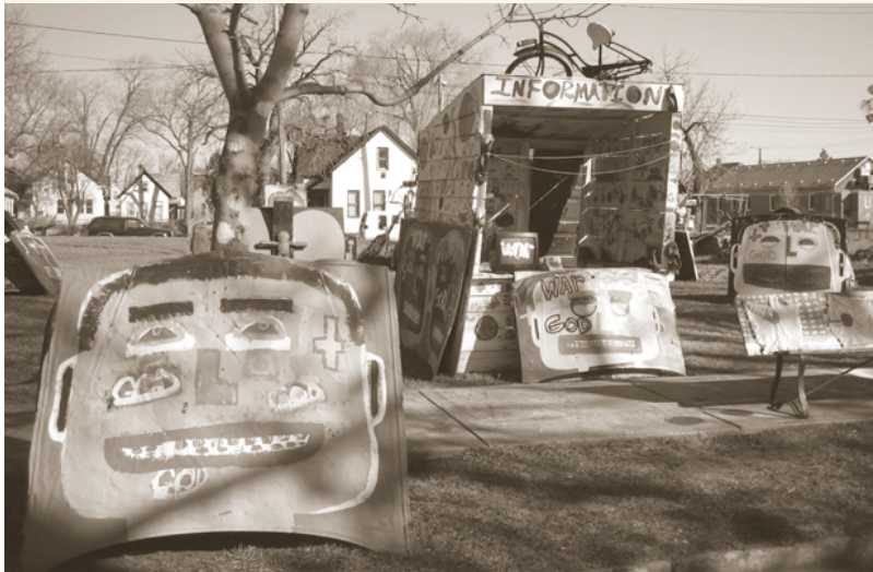
Visitor Information booth

The two centerpieces of the central lot are Faces in the Hood , an installation of car hoods grouped together and painted by Guyton with faces, forming a kind of bulwark at the center of the space, and Noah's Ark , a reclaimed fiberglass boat, painted with polka dots and filled to overflowing with discarded stuffed animals of all descriptions. Also on the lot are a picnic table, another highly decorated tree, the