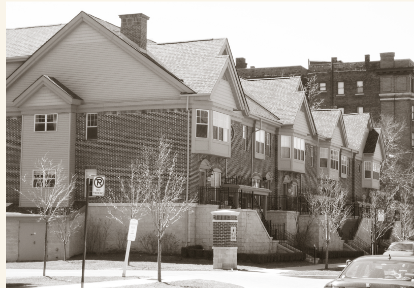
Left: Building being renovated for housing Right: New housing near downtown

the price of units to be built ranges from million dollar homes to affordable units. Consistent with the goals of the Planning and Development Department, many of those moving into the downtown are either young professionals, working for the new companies, or empty nesters who want to move back into town. Detroit is eager to keep young professionals in the city, as they are crucial to the economic and intellectual well being of the city. These two populations have created a demand for new loft housing, restaurants, services, and entertainment, and are beginning to bring life back into the downtown