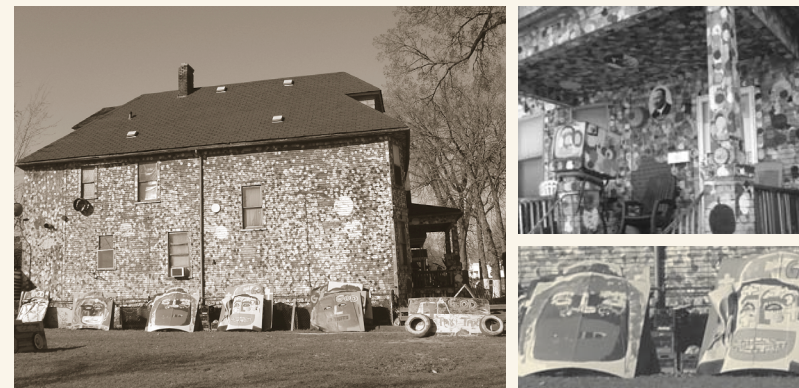
Dotty Wotty House, with details of the porch and “Faces in the Hood”