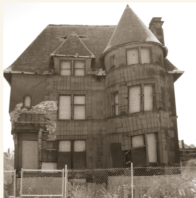
Houses near downtown Detroit