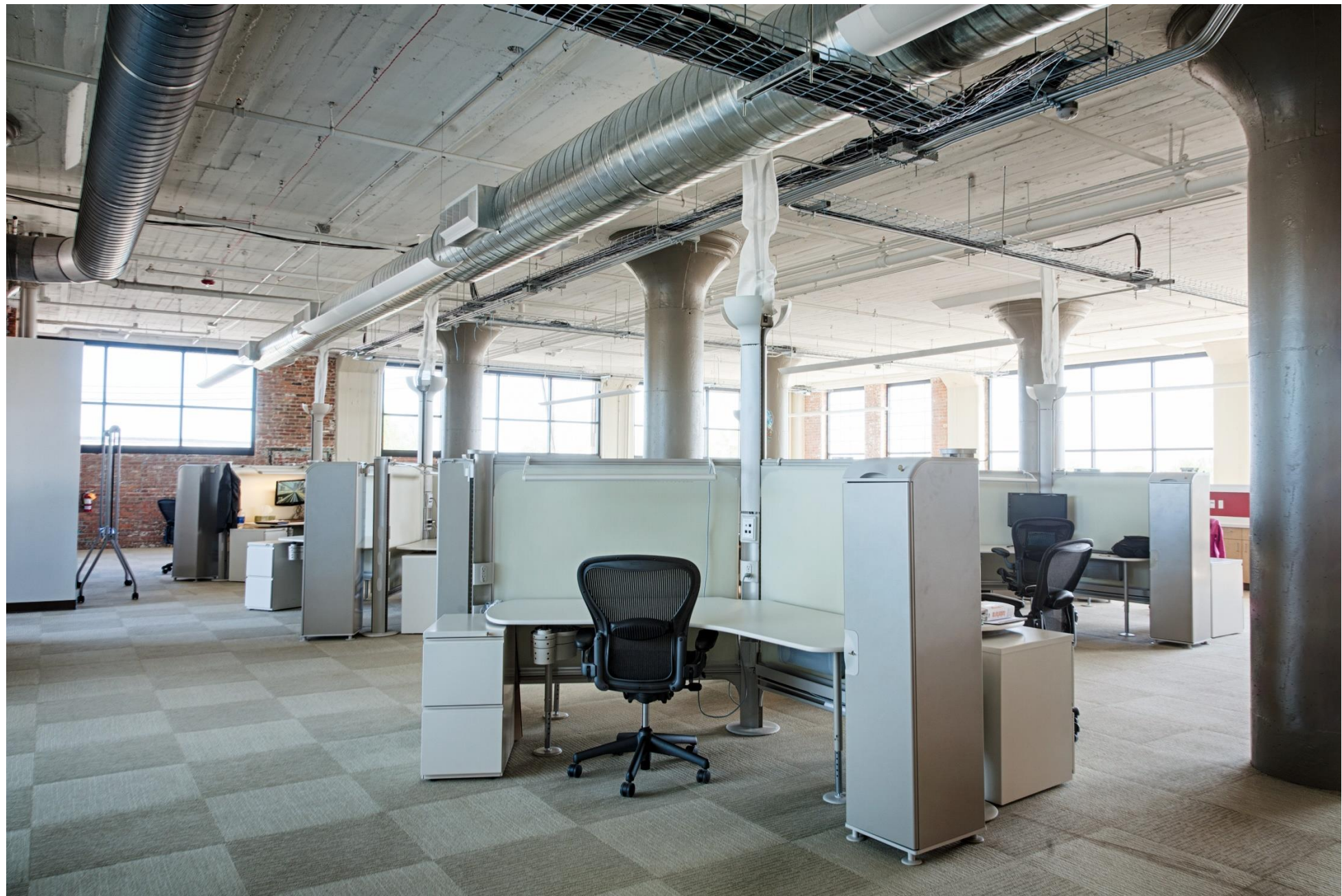
Talis Clinical, photo by Lauren Pacini.