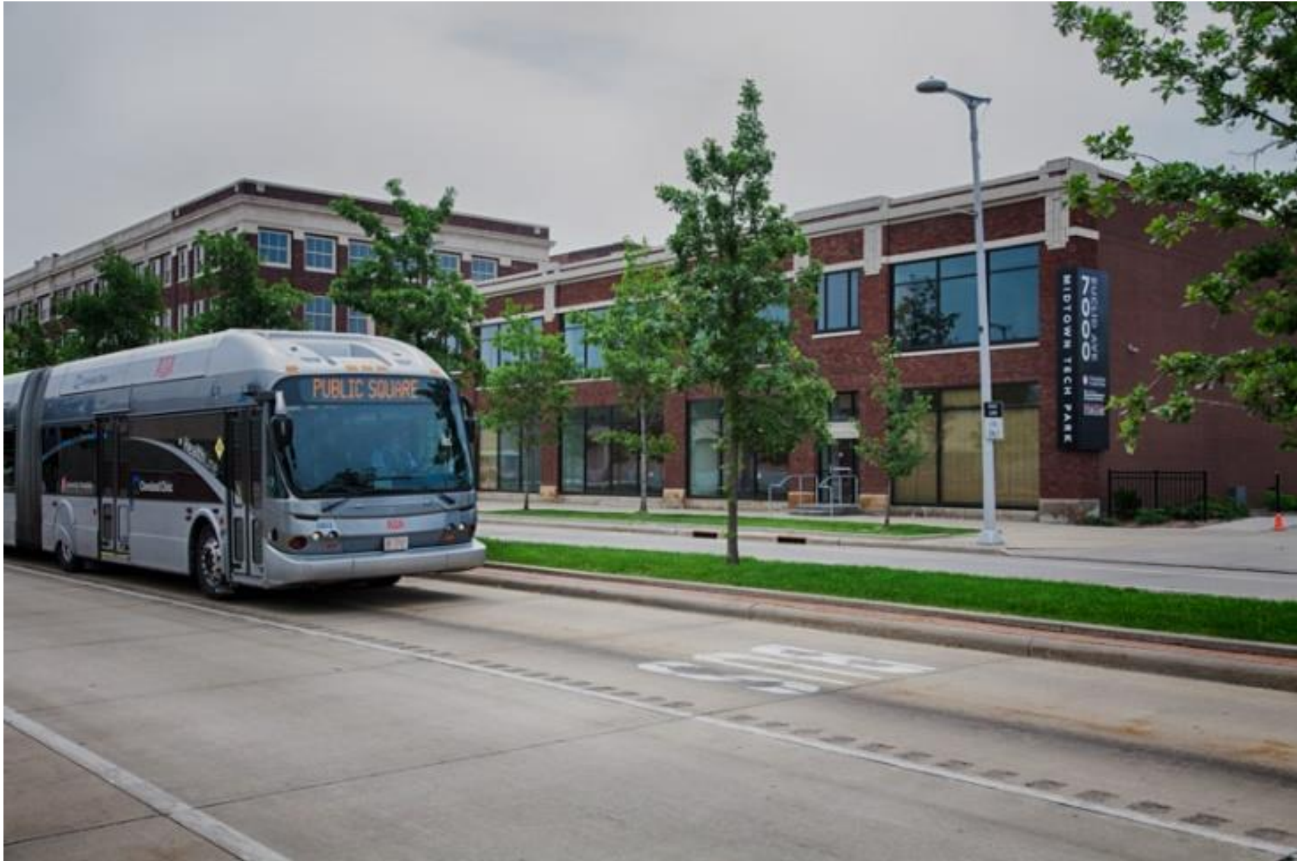
Building 2, built to the street along the HealthLine.