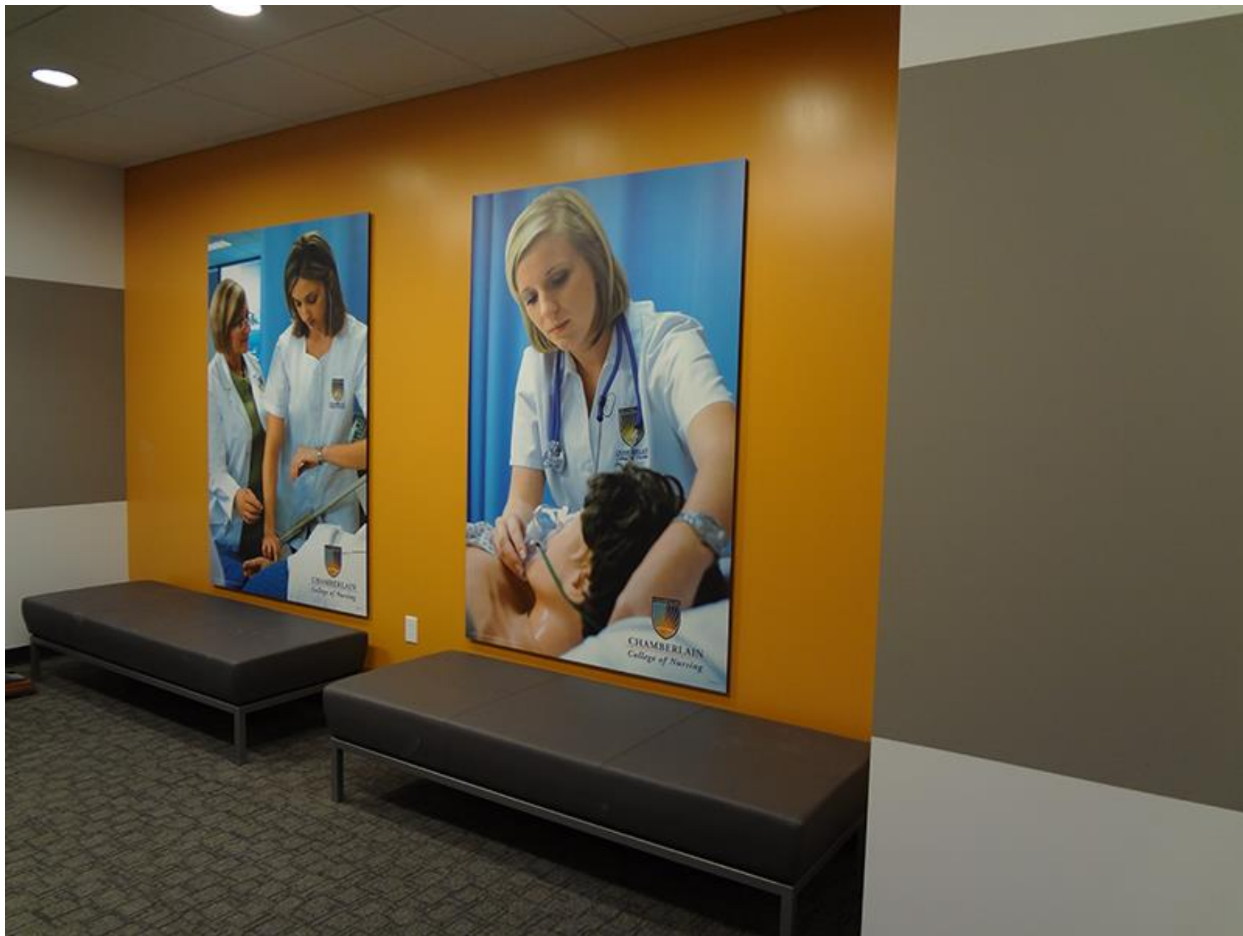
Chamberlain College of Nursing