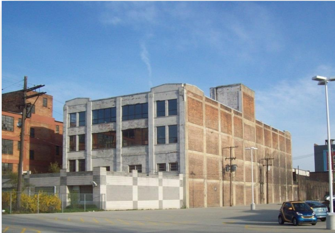
Pre Development (November 2012)