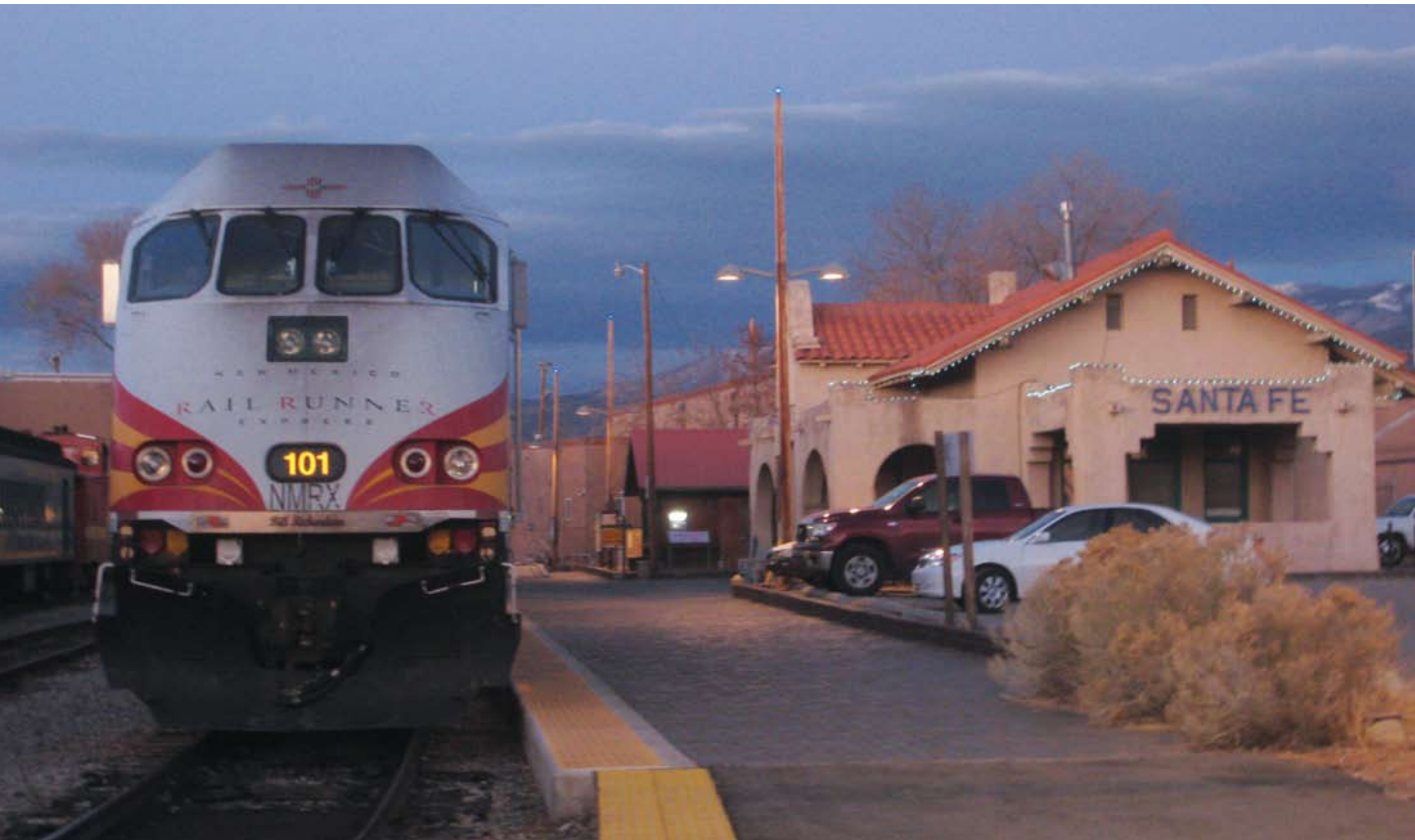
Historic Santa Fe Railway Station