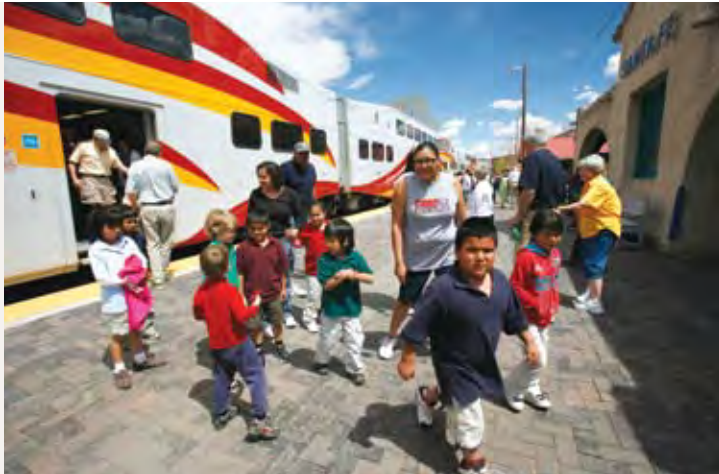
Santa Fe New Mexican

than 300%. The Railyard Stewards is a volunteer-reliant organization. They currently have a very strong and active base of volunteers assisting with Park maintenance and educational programs; however, their capacity will vary with the depth and commitment of that volunteer pool.