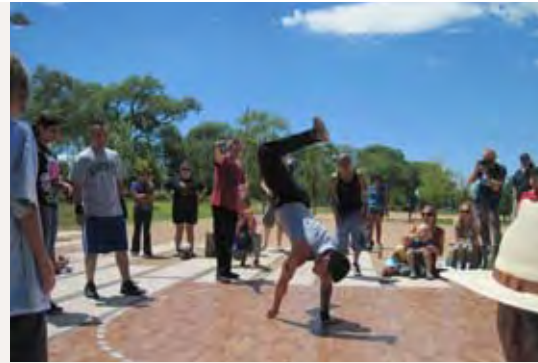
Railyard Park Stewards

Just south of Market Station is the proposed location for a 28,000 square foot, 12-screen IMAX cinema and café; Railyard Company, LLC is still seeking a national or regional cinema operator as a partner for this portion of the development.