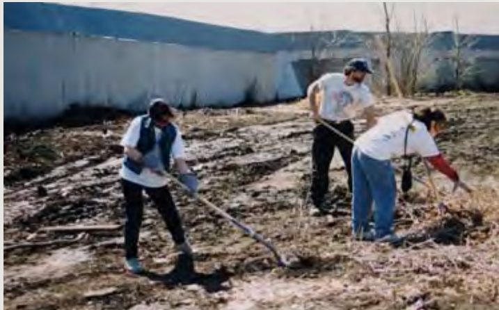
Neighbors begin clean up of Park site

The first cleanups began in the fall of 1998 and, according to Carter, the looming deadline of the "Golden Ball" event scheduled for Spring 1999 pushed the pace of the cleanup through the winter. There are few photographs of the site from that period, but all accounts indicate that it was a highly degraded space, with large-scale and heavy refuse from industrial and marine uses (such as huge links of anchor chains). The community received support for the cleanup from industrial neighbors as well as city agencies.