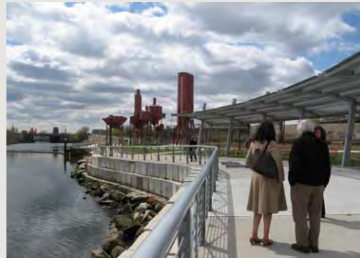
Views of Cement Park near Hunts Point

season. It has also become a site for festivals and special events such as Majora Carter’s wedding and the starting of The Point’s annual Fish Parade. It stands out as a lush, green space amidst industrial neighbors. When the wholesale market closes in mid-afternoon, the park creates a presence on a street that is otherwise largely empty. The Park’s place in the community and the process used in bringing it about seem to have had an impact on its immediate neighbors, most obviously seen in the environmentally-conscious elements added at the scrap yard site. And, without the Park, it is unlikely that the neighboring brownfield “fur factory” space would have been acquired, remediated and developed as the José E. Serrano Riverside Campus for Arts and the Environment.