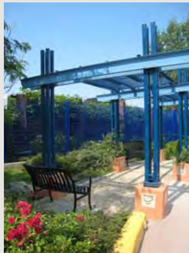
Views of playground, dock, and trellised seating area

The Bronx River flows on the east side of the Park. A gravel ramp and a dock provide access to the water. This area of the river is tidal, serving barges and recreational boats. The south side of the Park is