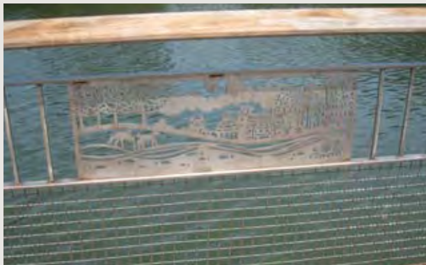
Detail of railing at dock

There are also ambitious ideas for adding value to the market in several ways, perhaps not directly caused by Hunts Point Park, but supported and reinforced by its success. Currently, the market is open only to wholesale buyers. There are plans to add retail operations in the Fulton Fish Market and other purveyors' shops, creating a destination site for local residents and visitors. There are reported to have even been very preliminary discussions about the potential for creating working piers for the Fulton Fish Market that would bring commercial fishermen down the Bronx River for the first time in over a century.