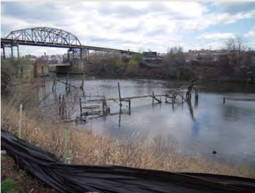
View of Bronx River near Hunts Point