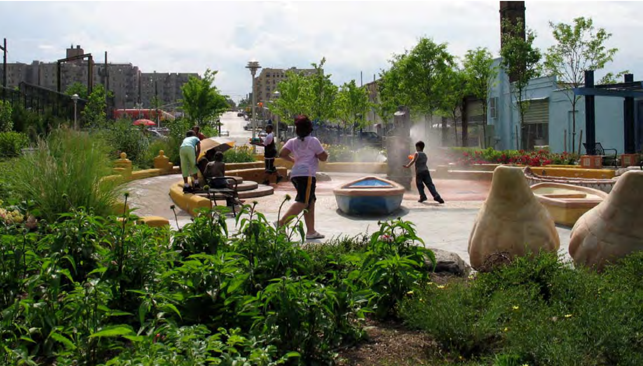
Neighborhood children in Hunts Point playground