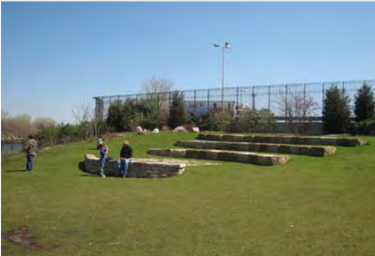
Amphitheater at Hunts Point