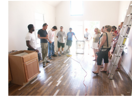
The Holding House