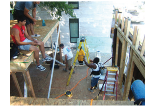
Frankie's Home (4529)