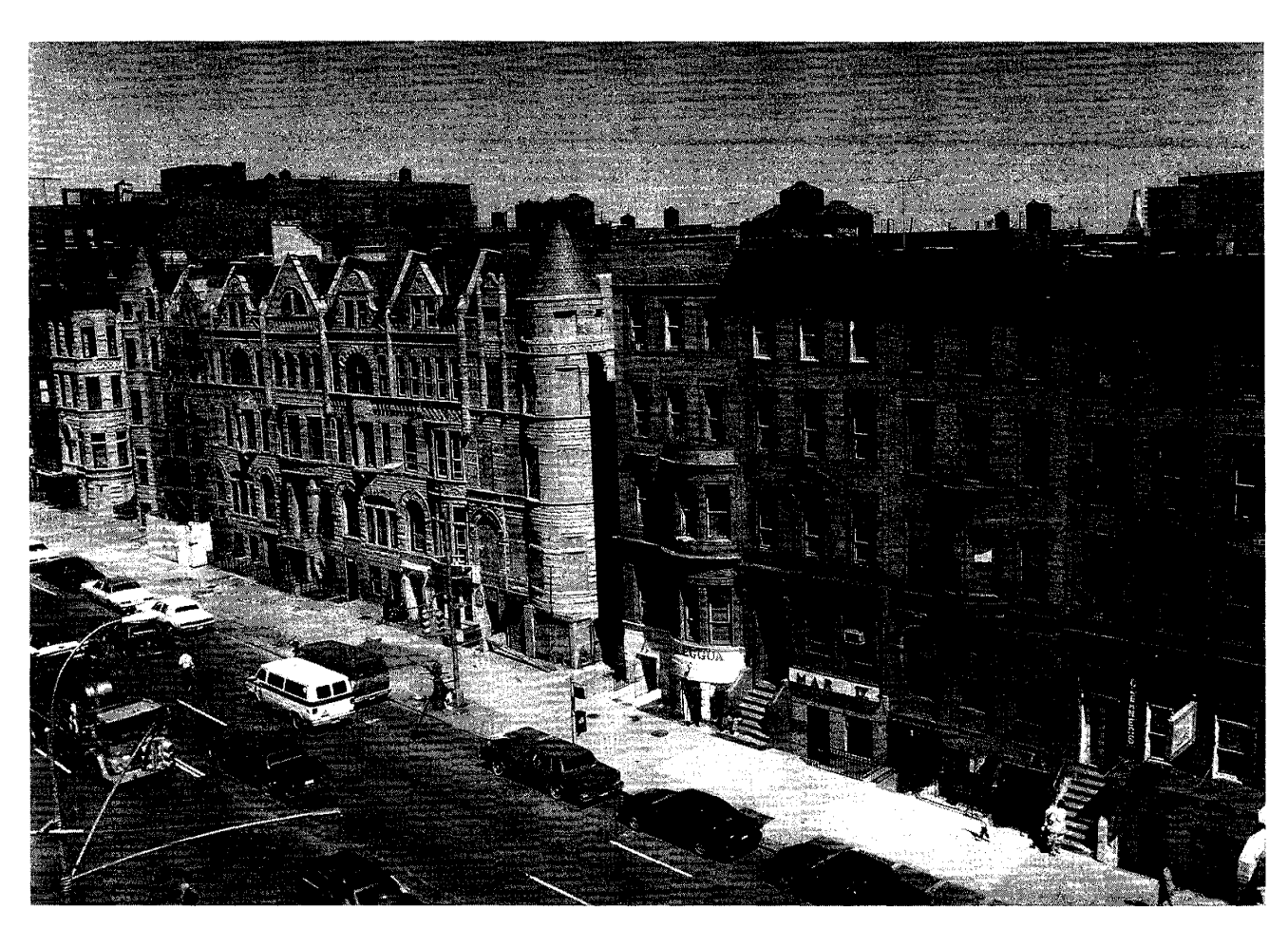
Unlike other city programs that have addressed Harlem's housing crisis, TIL succeeded by depending on the initiative and persistence of the residents.

TIL started with inadequate staff. The first group of buildings were the ones out there chomping at the bit to get a chance to manage themselves. We were taking in as many buildings as we could. Went from zero to three hundred buildings very quickly. The feeling was that the tenants were coming to us and that the first hurdle they had to get past was to come to us and say they wanted to take part.